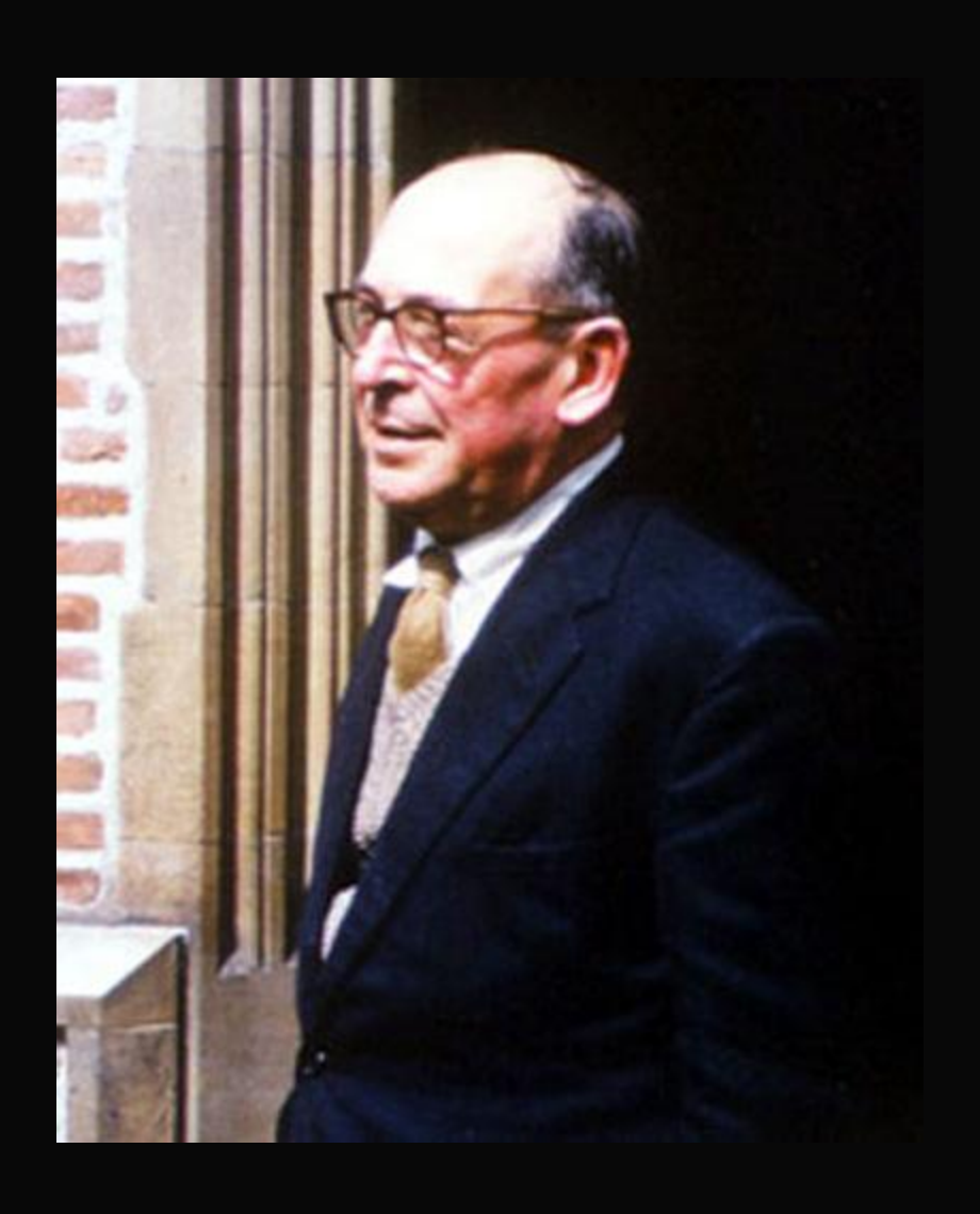
Clive Staples Lewis ("Jack")