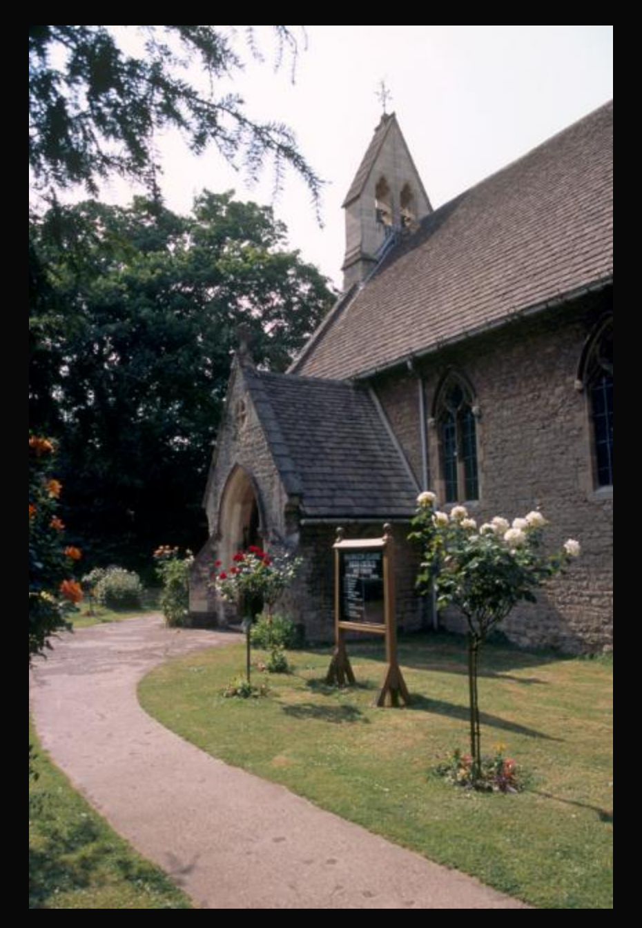
Holy Trinity Church